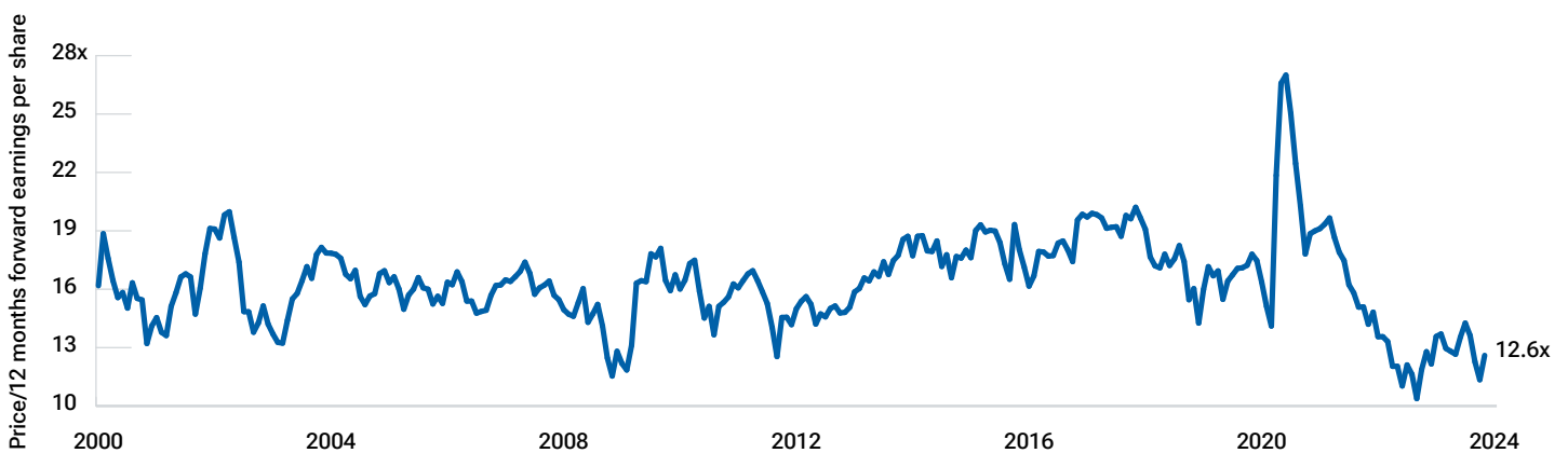
(Fig. 1) S&P 600 Forward P/E Ratio

January 1, 2000, through November 21, 2023.