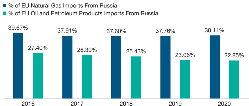
(Fig. 1) Percent of annual EU natural gas or oil and petroleum products sourced from Russia*