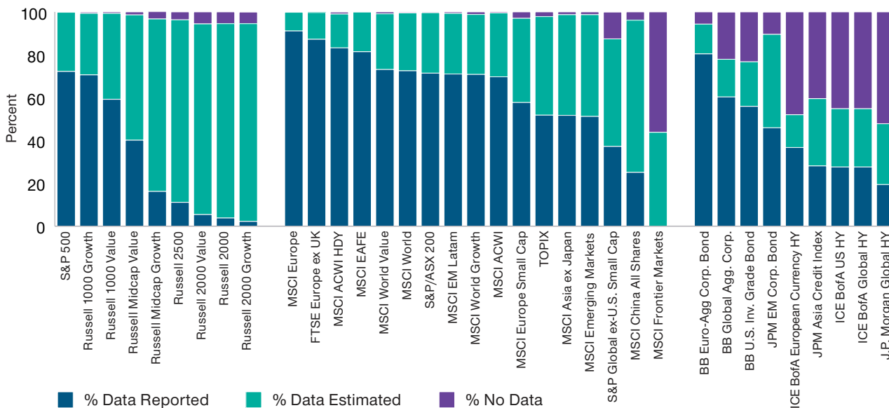
(Fig. 2) Carbon emissions data availability by index

Agg. Corp Bond = Aggregate Corporate Bond; BB = Bloomberg Barclays; HDY = High Dividend Yield; HY = High Yield; S&P/ASX 200 and TOPIX represent Australia and Japan stocks, respectively. Chart depicts carbon emissions data disclosed by constituent companies of each index.