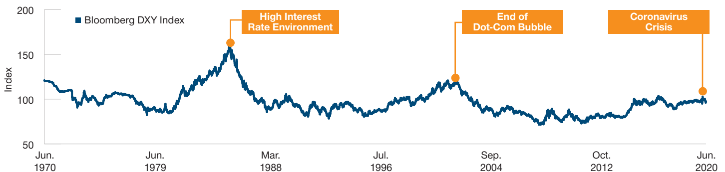
(Fig. 2) It could be reaching the point when previous rallies reversed.