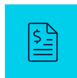
Personalized Portfolios powered by Morningstar Investment Management LLC 1