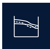
Retirement Glide Path

Our digital experiences integrate direct links to Financial Academy . Prominent messages are visible and accessible for participants in plans that adopt this capability.