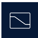
Target Date Glide Path