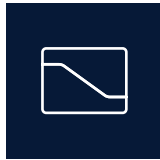
Target Date Glide Path