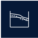
Retirement Glide Path

Our digital experiences integrate direct links to Financial Academy . Prominent messages are visible and accessible for participants in plans that adopt this capability.