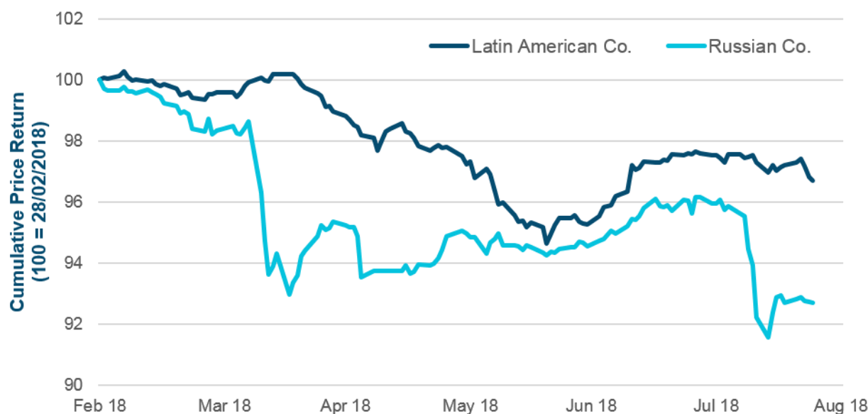
Figure 2. A Tale of Two Metals Companies

Past performance is not a reliable indicator of future returns.