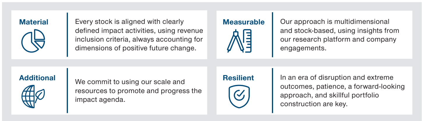
Exhibit 1: Impact Charter