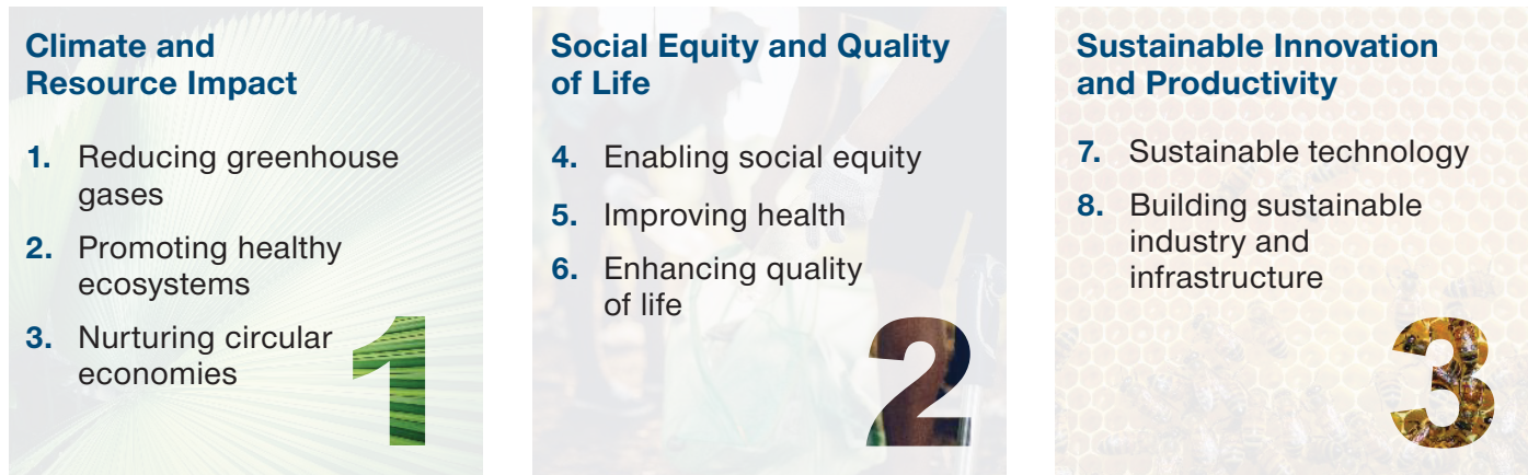
Exhibit 2: Impact Pillars and Activities