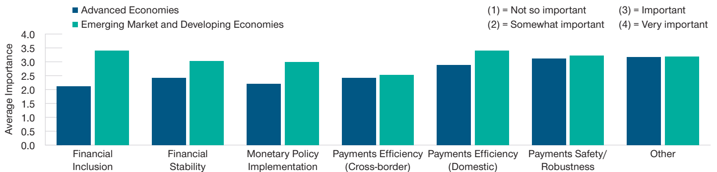
(Fig. 1) Payment safety is the main reason in OECD countries

As of December 31, 2020.