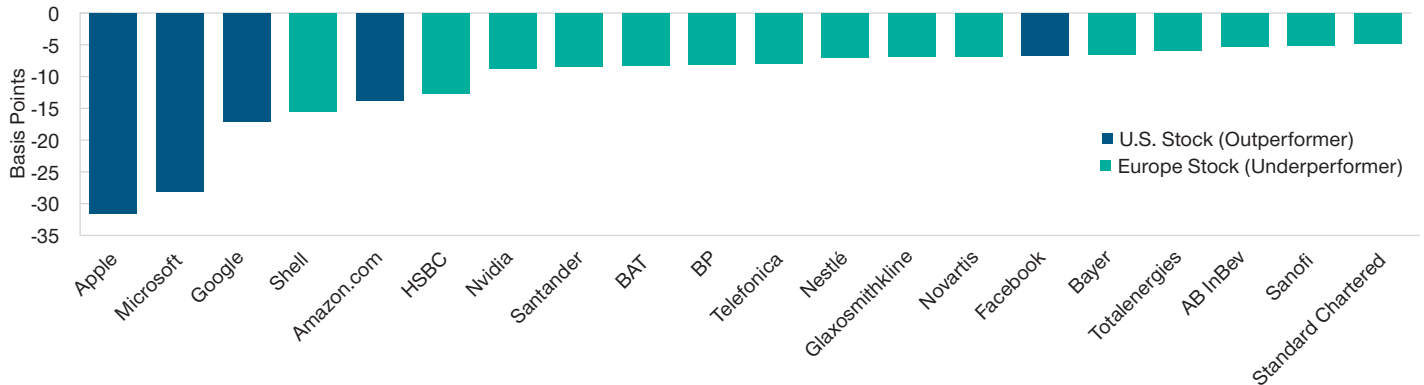
(Fig. 2) Biggest adverse impacts on relative performance between Europe (MSCI Europe Index) and the U.S. (S&P 500 Index)