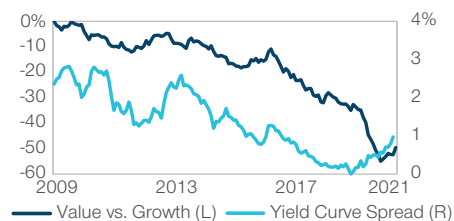
Historical Stock Valuations vs. Interest Rates 2